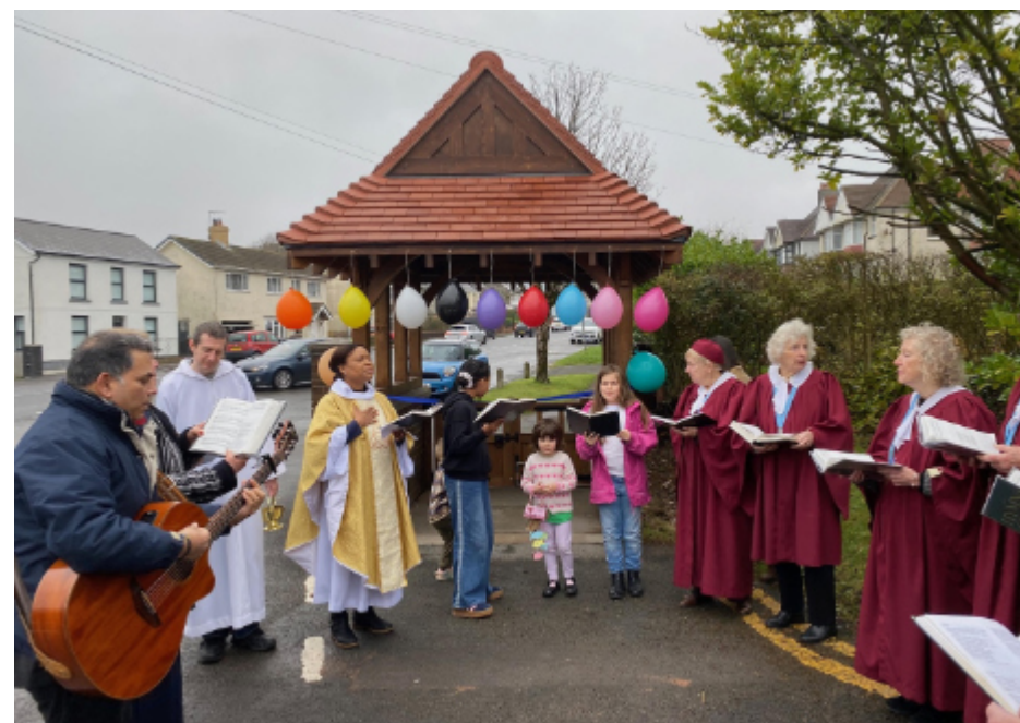
We ended our service outside, giving thanks for our refurbished lych gate.