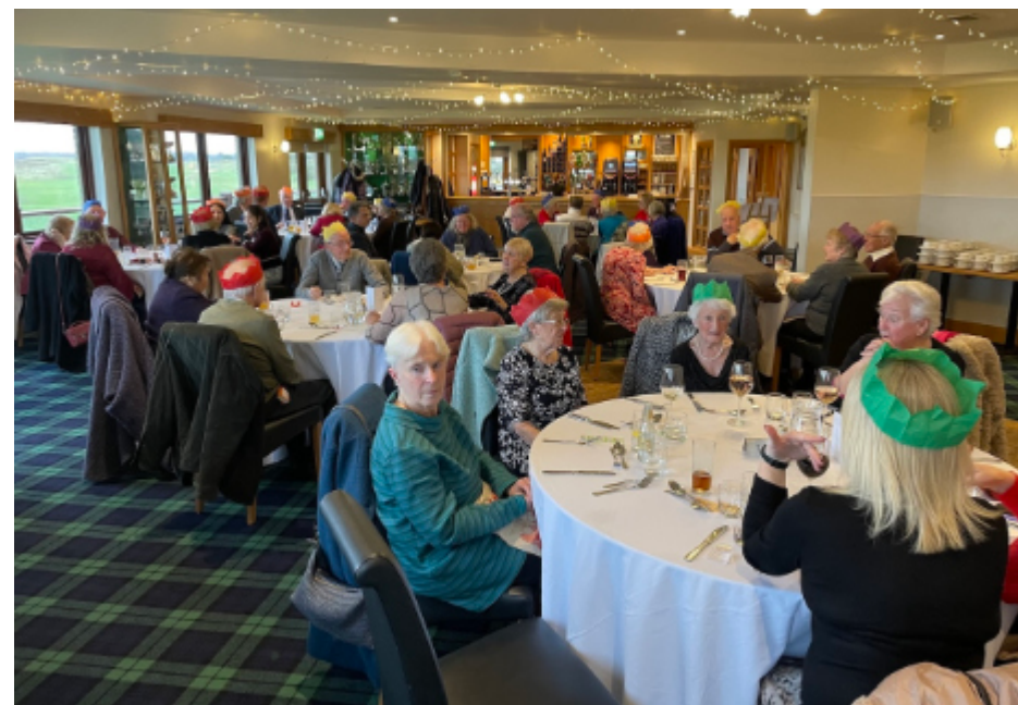
East Cluster New Year lunch held this year at Pennard Golf Club