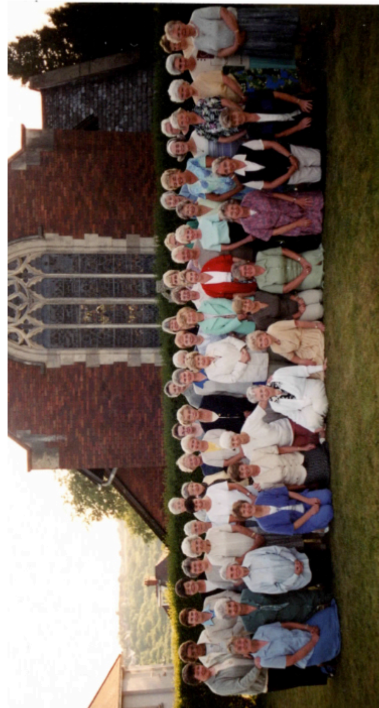
Thanks to Noreen Shapton for this retro photo of Ladies Guild