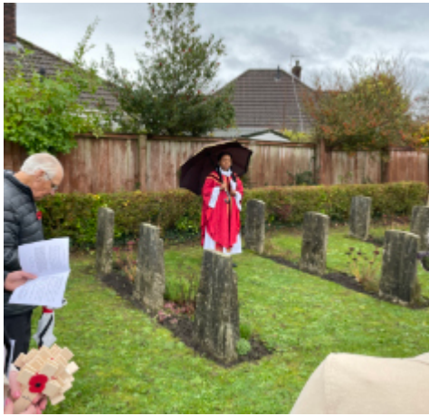
Remembrance Service at war graves St Hilary, Killay. November 2025.