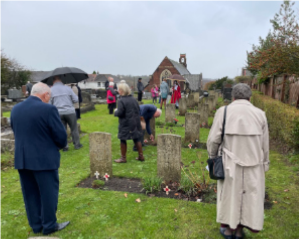
Below - Remembrance Service at St Martin's Church