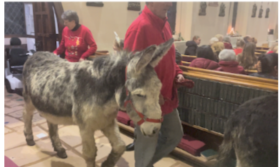
Nativity Service with Carols plus a couple of donkeys to complete the Nativity scene at St Hilary's