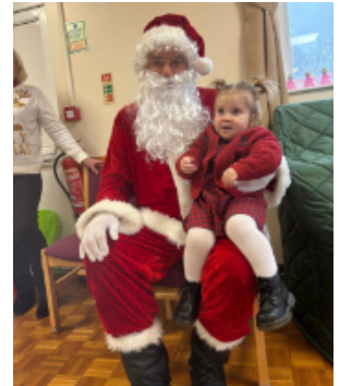
Tots Christmas Party at St Hilary's Church Hall, there were 20 children and a real Father Christmas!